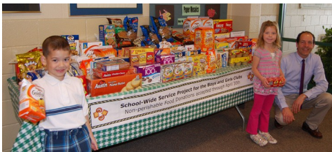
Penn View Christian School students donated snacks to Manna on Main Street and the North Penn Boys and Girls Clubs as part of an All School Service Project.