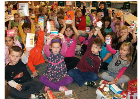
First grade students from Penn View Christian School collected food to pack Thanksgiving meals for Keystone Opportunity Center in Souderton, that will be shared with "neighbors".

The Theory of Multiple Intelligences was developed in 1983 by Dr. Howard Gardner, professor of education at Harvard University. Dr. Gardner theorized that the traditional notion of intelligence, based on I.Q. testing, is far too limited. Instead, he proposed eight different intelligences to account for a broader range of human potential in children and adults. His research suggests that teachers should be trained to present their lessons utilizing a wide variety of methods including using music, cooperative learning, art activities, role play, multimedia, field trips, inner reflection, and much more. 7 By providing service opportunities outside of the classroom, some students who generally do not achieve highly in the classroom may find opportunities to achieve in new ways. Because grades are not awarded in many contexts where students engage in service, some students who experience performance anxiety or fear of failure in the classroom may discover new freedom to attempt and achieve. In these ways, service opportunities can provide avenues of success for students who may not realize such success in the classroom.