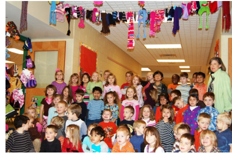
Early childhood students from Penn View Christian School collected scarves, hats, gloves and mittens for the Keystone Opportunity Center in Souderton.

servants” who build “God’s Kingdom locally and globally,” we also knew that doing service is integral to our mission in ways that go beyond simply a means for effective teaching and learning. Although far from being exhaustive, this document is intended to foster an ongoing discussion within our church, home, and school communities as to why, and for what