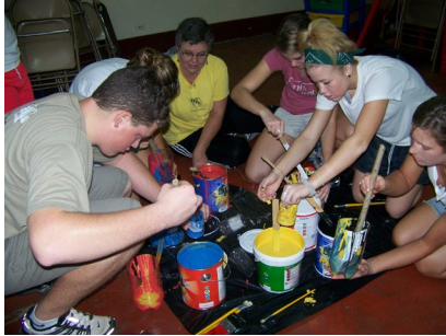
Christopher Dock Mennonite High School Seniors help paint MAMA Project's Nutritional Rehabilitation Center in Honduras.