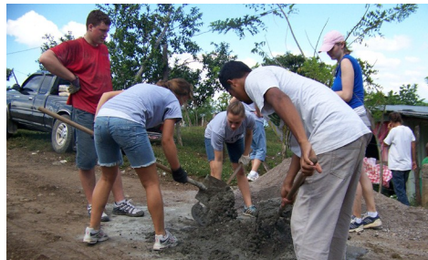
In Honduras, Christopher Dock Mennonite High School Seniors mix cement to pour for the floor of a poor family’s home.

Based on these significant discoveries, new instructional techniques are developing. Among these are: a.) students learn best when they are fully immersed in an active learning environment, and, b.) students’ learning is inhibited by fear of failure (performance anxiety) and enhanced in the presence of challenges requiring